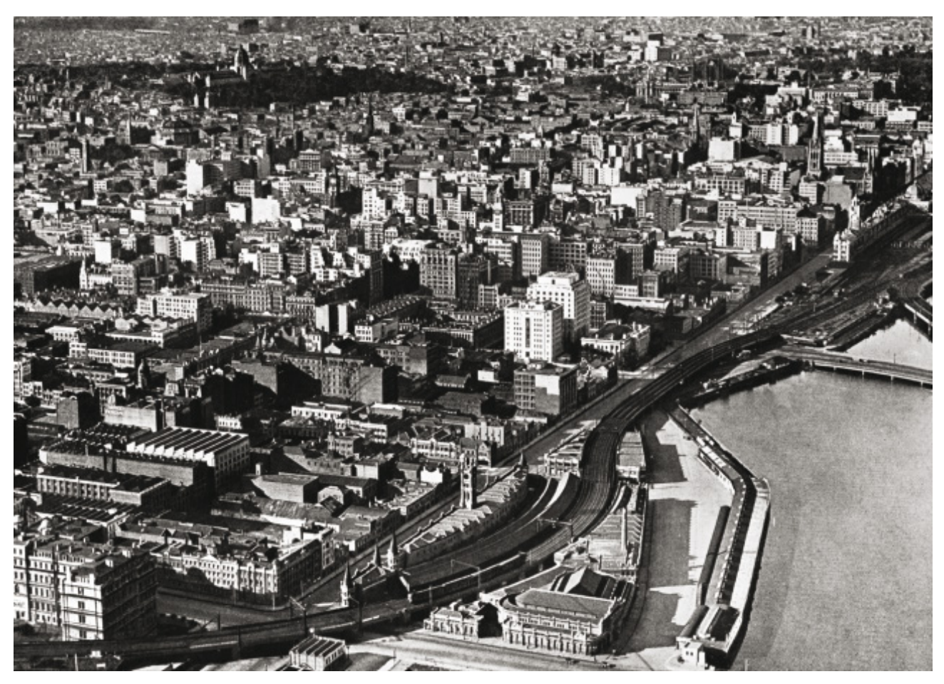
Flinders Street c. 1934 Reproduced from Souvenir Album: Views of Marvellous Melbourne, the Garden City of the South, Melbourne, Osboldstone & Co., 1934. RHSV BL001-006