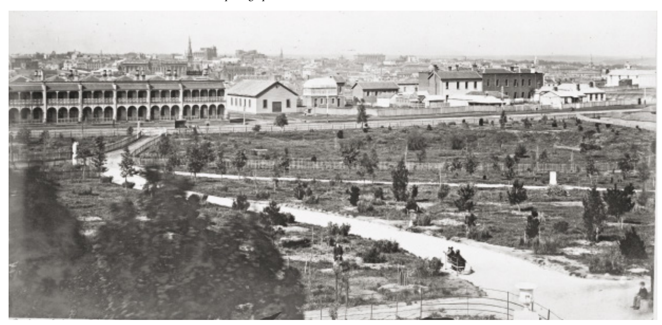
Flagstaff Gardens 1866