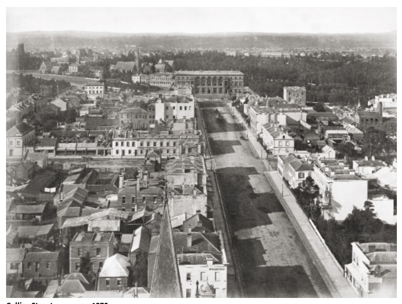
Collins Street panorama 1875 Paterson Brothers photographer. RHSV AL001-0012