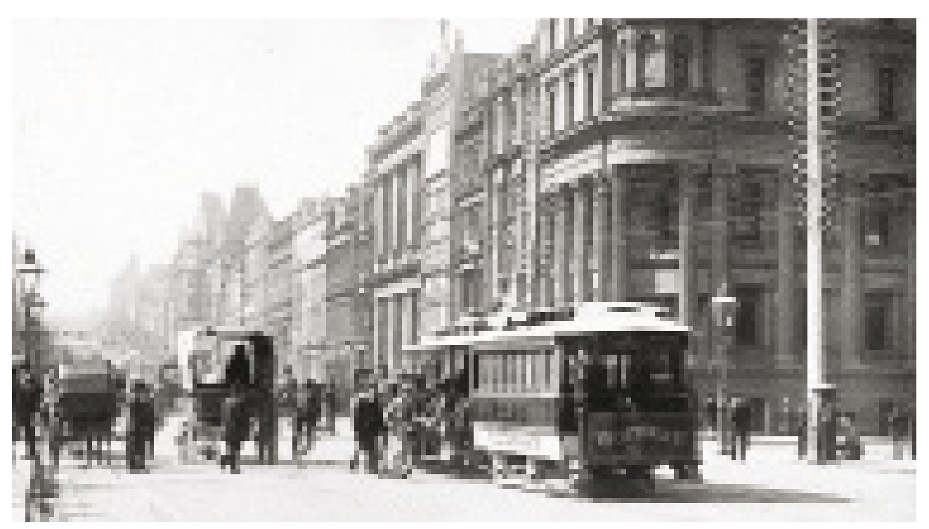
Collins Street looking east from intersection with Elizabeth Street \emph{c.} 1892 \emph{RHSV} \emph{GS-CS-35}