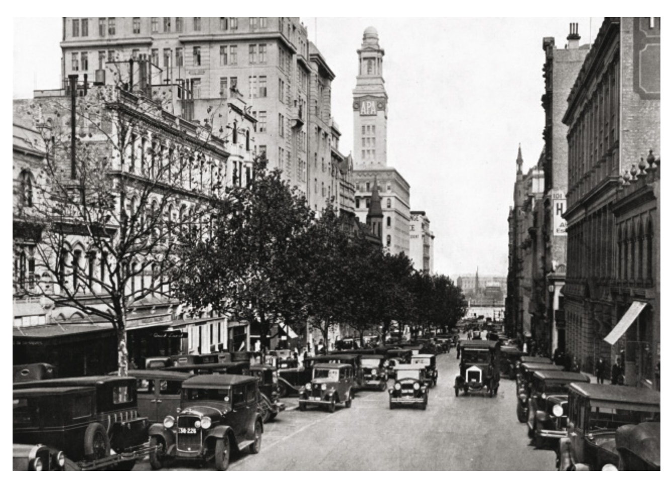
Queen Street looking south from Chancery Lane showing the APA Building \emph{c.} 1934 \emph{RHSV BL001-025}