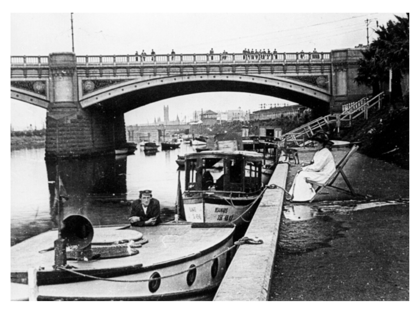
Looking west along Yarra River from below Batman Avenue 1906

G.\ Attwood,\ Chemist,\ 64\ Bourke\ Street,\ Melbourne,\ photographer.\ \ RHSV\ D-397.002