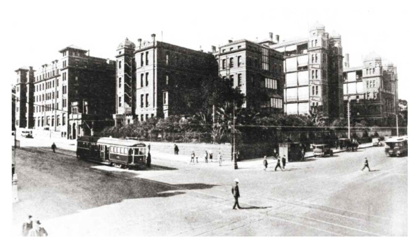
Melbourne Hospital from corner Swanston and Lonsdale streets \it c . 1929

Charles Nettleton photographer. Courtesy State Library of Victoria H88.22/16