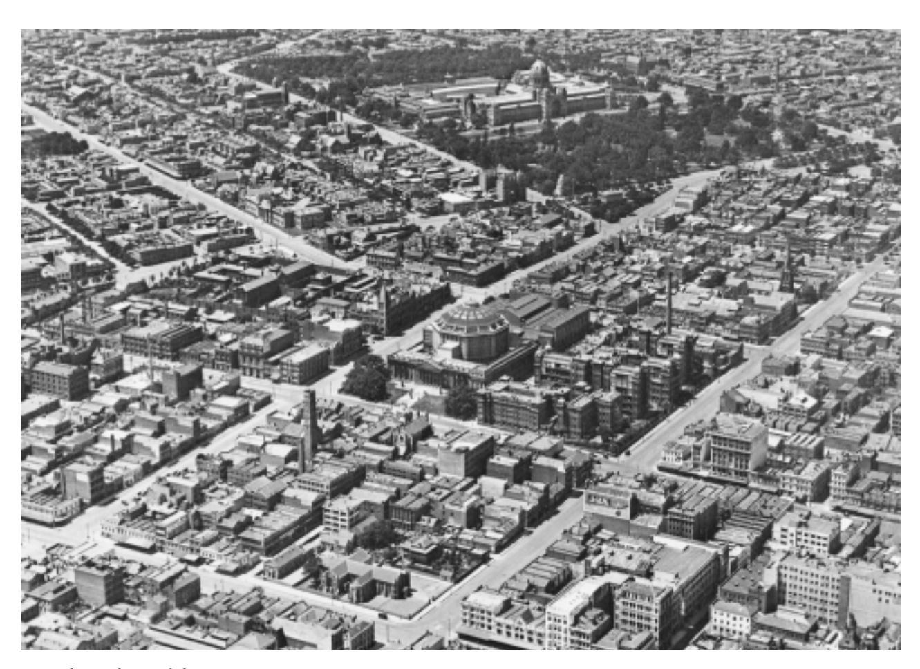
La Trobe and Lonsdale streets c. 1927 Airspy photographer. Courtesy State Library of Victoria H2503