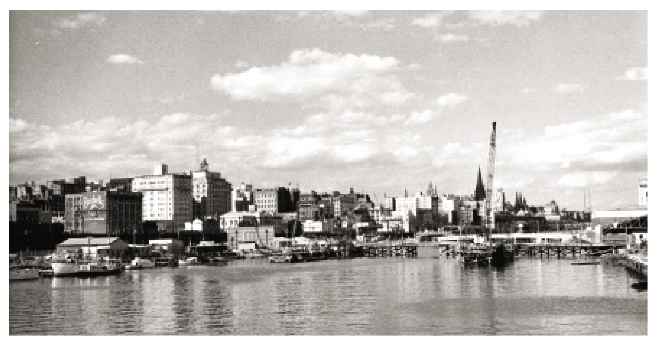
Looking east along the Yarra River, showing city buildings and preliminary work on King Street Bridge, 7 February 1959

Peter Dunbar photographer. RHSV PH-150021