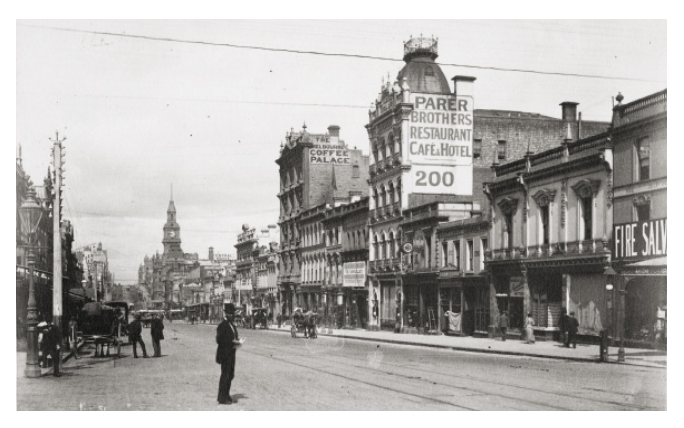
Bourke Street looking west from Russell Street 1899

Henry\ Cooper\ Studio\ photographers.\ RHSV\ S\text{-}40