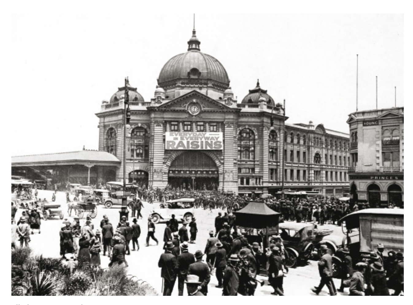
Flinders Street Station entrance c. 1920

the Queen Victoria Market. Professor Sowerwine has led the Committee's engagement with this issue. It involves an incredibly complex and extensive set of Council actions: development of the 'Munro' site immediately south of the market (a 200m tower is proposed); replacing the carpark over the cemetery with a park and a street (New Franklin Street, which will continue Dudley Street through to Franklin Street, leading to Victoria Street); and dismantling the market sheds in order to restore the building materials but also to build underground services and car parking that may compromise the existing functions of the sheds. On 12 October 2016 members of the Committee met with Amy Lees, representing the City of Melbourne. Drawing on this discussion, Professor Sowerwine wrote 'Plans for the Queen Victoria Market: Heritage and High Rise', in November-December 2016 History News. The Committee continues to work on this issue in cooperation with the National Trust and in the interests of conserving the heritage value of the market in accordance with the principles of the Burra Charter and the Australian Heritage Council.