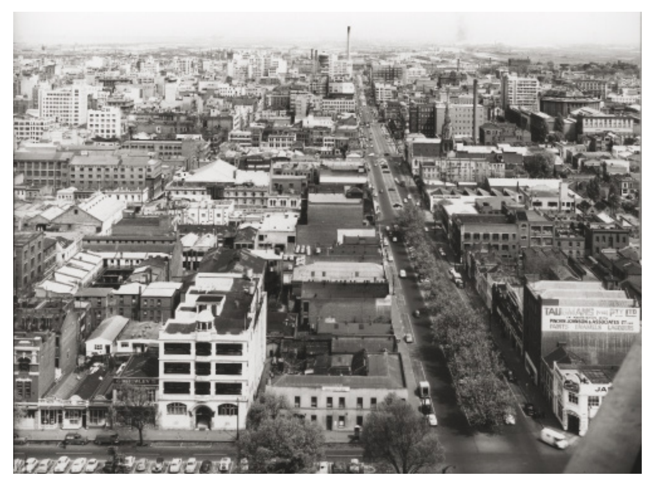
Looking west along Lonsdale Street from intersection with Spring Street \it c . 1960

Peter Dunbar photographer. RHSV PH-150021