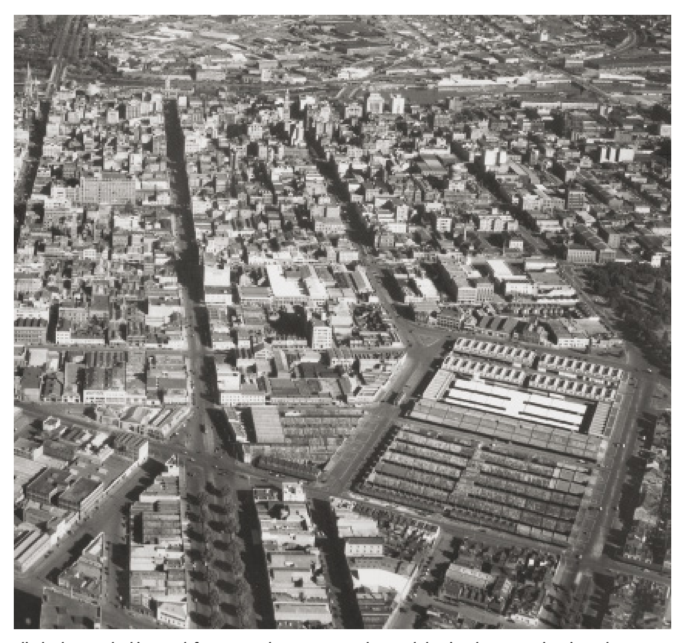
Elizabeth Street looking south from Queensberry Street, Carlton, and showing the Queen Victoria Market, c. 1938