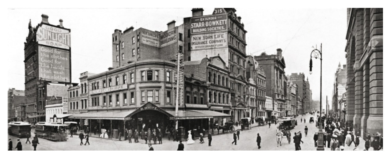
South-west corner Elizabeth and Collins streets c. 1895