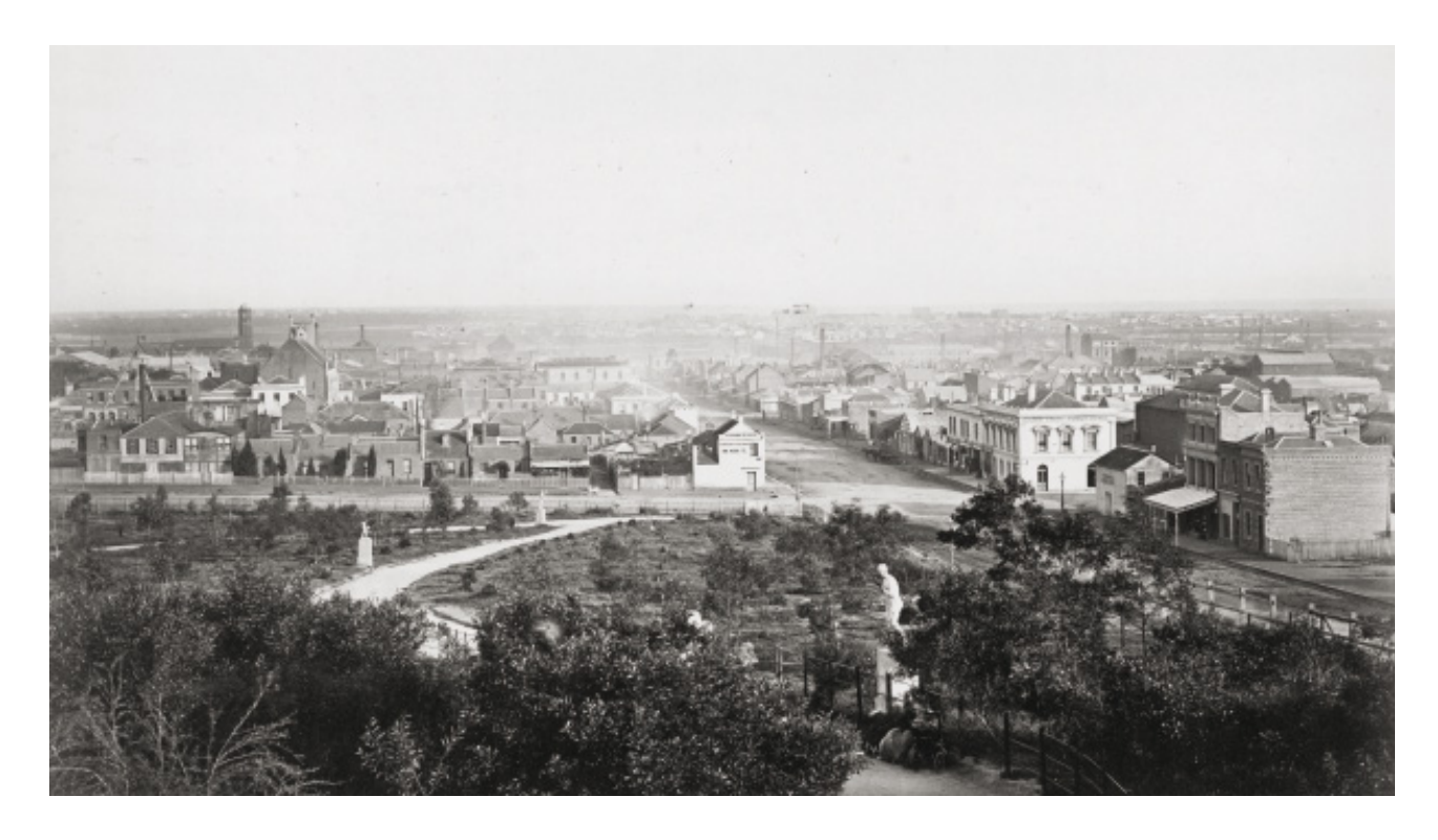
Looking south west from the Observatory, Flagstaff Gardens, to La Trobe Street and its intersection with King Street, 1866

Charles Nettleton photographer. Courtesy State Library of Victoria H88.22/16