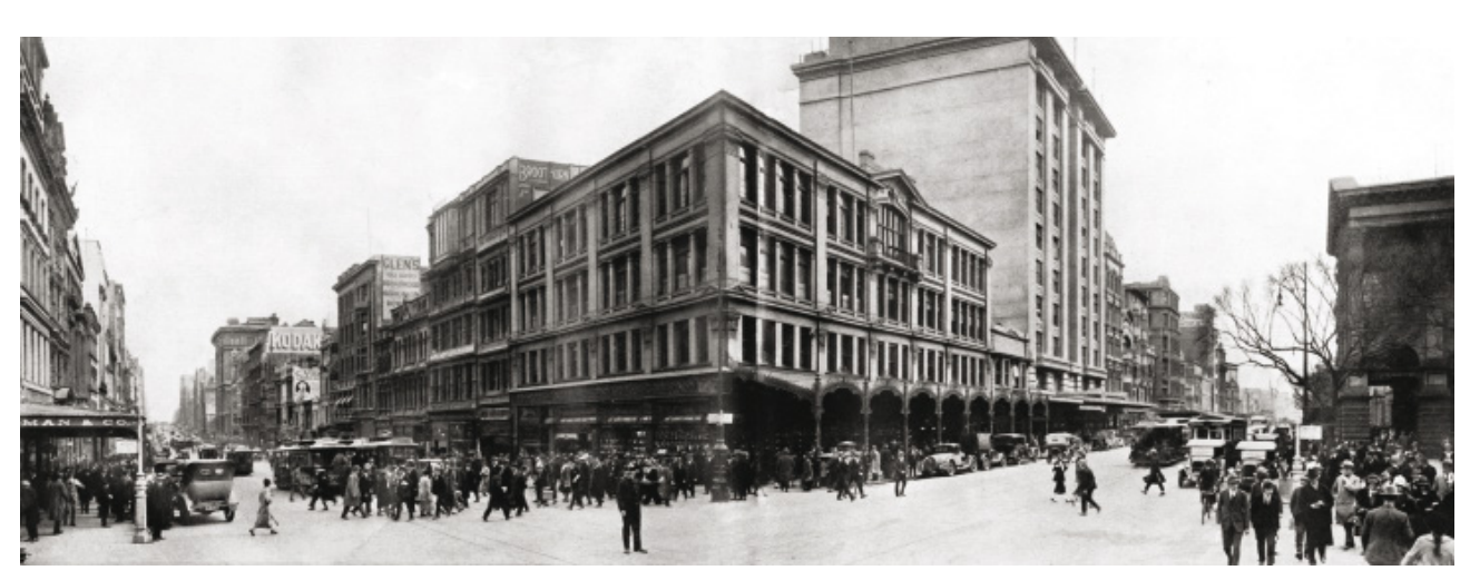
Collins and Swanston streets corner looking west and north c. 1924 RHSV BL010-006