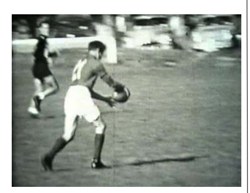
Action from a Rupanyup vs Murtoa game, late 1950s.