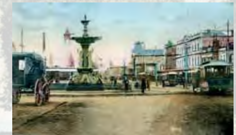
Main Street, Bendigo