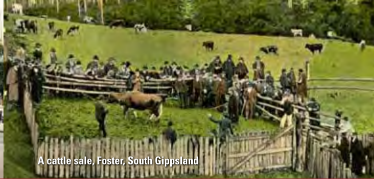
A cattle sale, Foster, South Gippsland