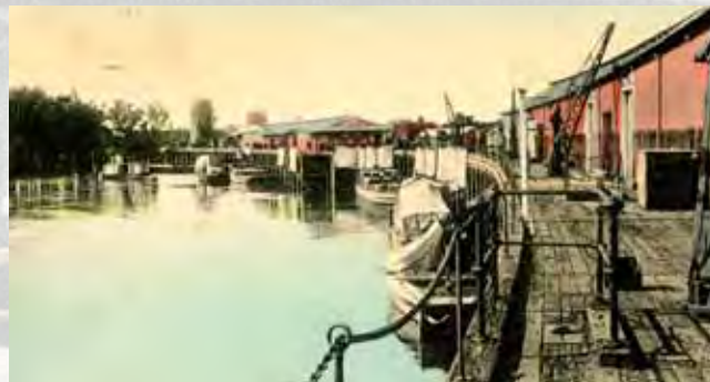
Wharf at Echuca