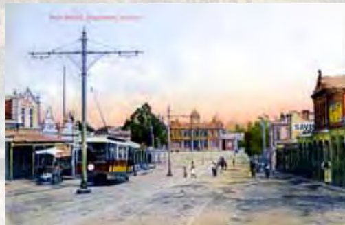
Main Street, Eaglehawk, Victoria