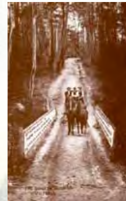
The road to Buchan

A visit to regional Victoria's local historical societies is often a history lesson in itself, being housed in some of Victoria's most magnificent historic buildings. From old court houses to funeral parlours and Mechanics' Institutes, there is a story behind every door.