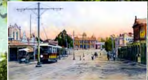
Main Street Eaglehawk