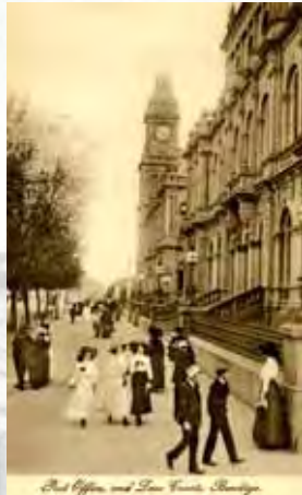
Post Office and Law Courts, Bendigo

To find out more about regional Victoria's historical societies, visit www.historyvictoria.org.au