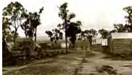
Main Street, Morwell

Committed to collecting, researching and sharing an understanding of the history of Victoria, the RHSV houses the most extensive single information resource on the history of Melbourne and Victoria.