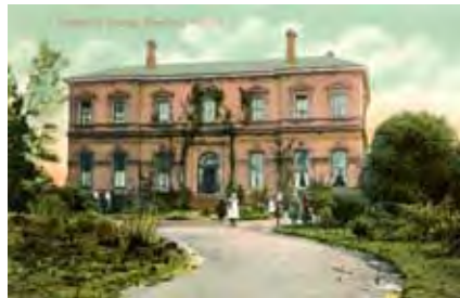
Alexandra College, Hamilton

Formed in 1909, the Royal Historical Society of Victoria (RHSV) is the centre of Victoria's history movement, encompassing over 1000 individual members and acting as the peak body for the many local historical societies.