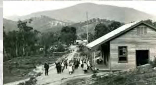
Eildon Weir School, school children physical drill