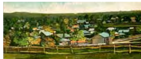
View of Chiltern