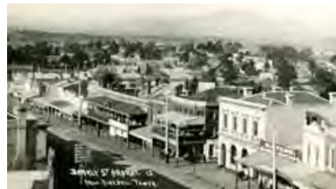
Barkly St, Ararat from Firebell Tower

To become an affiliated historical society or history group, email office@historyvictoria.org.au or phone (03) 9326 9288.