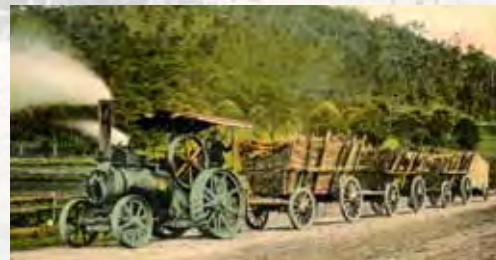
Mount Warrenheip, near Ballarat