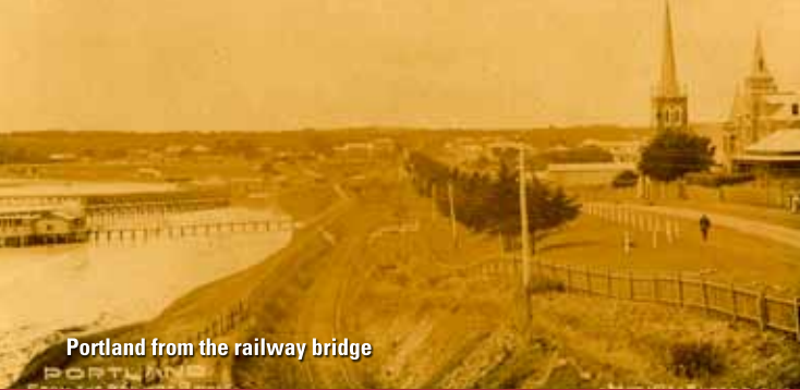
Portland from the railway bridge