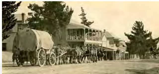
Corryong – an "express train" for Tallangatta