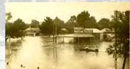
Flood in Seymour, 1916