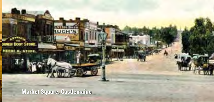
Market Square, Castlemaine