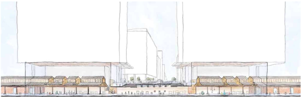
Drawing from page 53